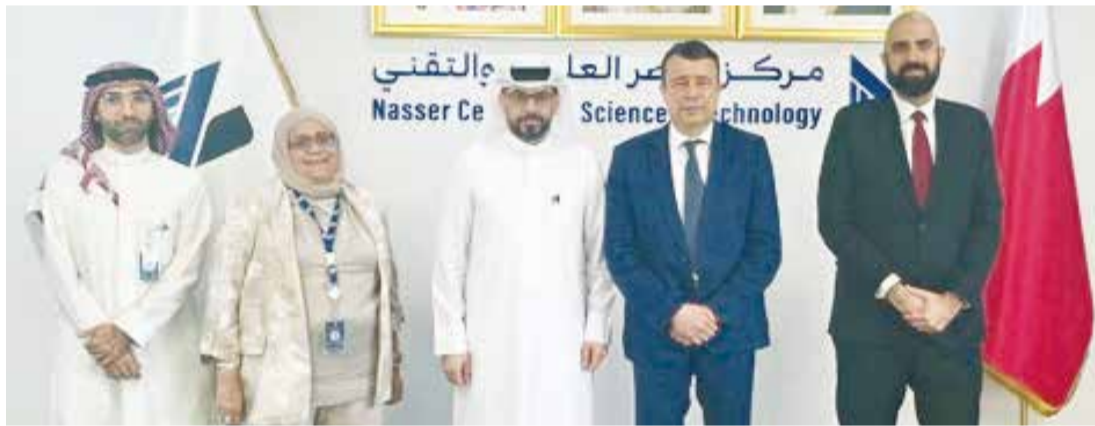
Nasser Centre and Arabian Gulf University strengthened their collaboration in the field of cybersecurity, marking a step forward in advancing Bahrain's digital capabilities and innovation ecosystem. Discussions between the two sides focused on enhancing student training through access to advanced cybersecurity facilities, expanding practical, hands-on learning programmes, and developing joint initiatives aimed at reinforcing digital protection systems.