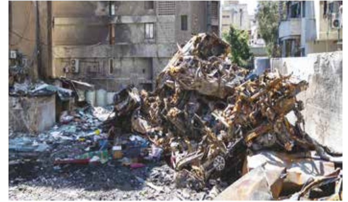
A residential building in Beirut, Lebanon, lies in ruins.

At least nine people were killed in southern Lebanon on Thursday as continuing hostilities intensified, deepening a humanitarian crisis marked by rising civilian casualties, worsening food insecurity, and strained public services.