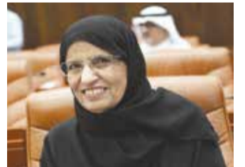
Lulwa Al Rumaihi, MP

The scheme also includes a rainwater drainage network, side pavements for pedestrians, underground ducts for future service lines, better lighting,