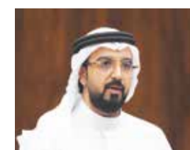
Hassan Ebrahim, MP

MP Hassan Ebrahim Hassan described the extension as a "national responsibility," urging lawmakers to accelerate key legislation affecting