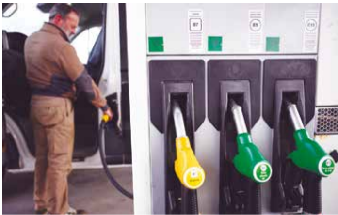
A man fills his truck with diesel at a petrol station in Saint-Etienne-de-Montluc, western France

At the start of the US-Israeli war on Iran in late February,