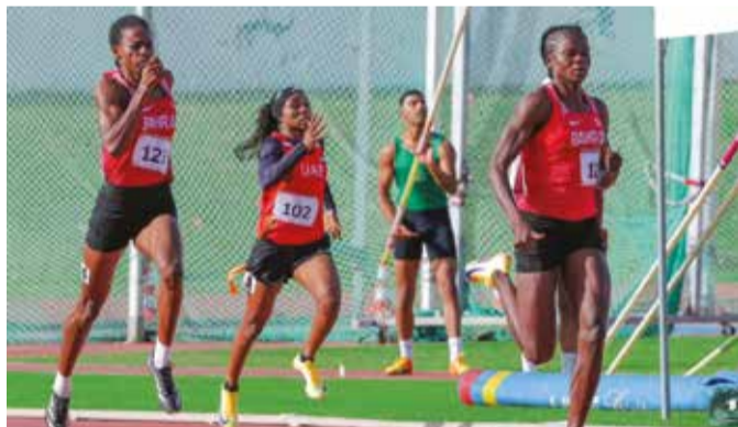
Action from Stade Olympique de Radès in Tunis, Tunisia.