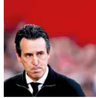
Aston Villa manager Unai Emery reacts during the match