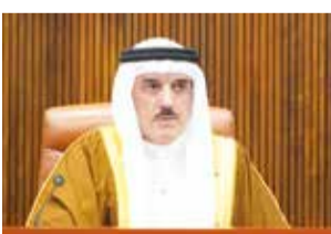
Ahmed Al Musallam, Parliament Speaker

Al Musallam said the extension reflects royal confidence in the legislature and will guide MPs and Shura Council members in advancing national work, noting