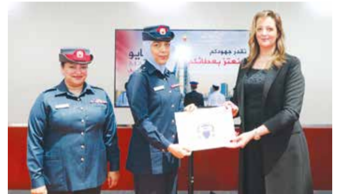
The Health and Social Affairs Department marked Labour Day with a ceremony recognising employees for their continued contributions to work operations and the delivery of healthcare services to Ministry of Interior personnel. The event also honoured a number of outstanding staff members in appreciation of their dedication and commitment to their duties.