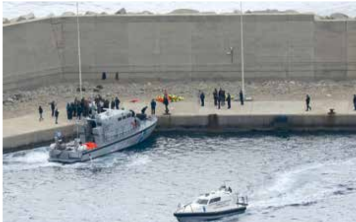
Activists from the Global Sumud Flotilla stand at the port of Atherinolakkos on the island of Crete after disembarking from a Greek Coast Guard vessel

Turkey's foreign ministry said some 20 Turkish nationals in the flotilla who had been grabbed by the Israeli forces and taken to Crete would be