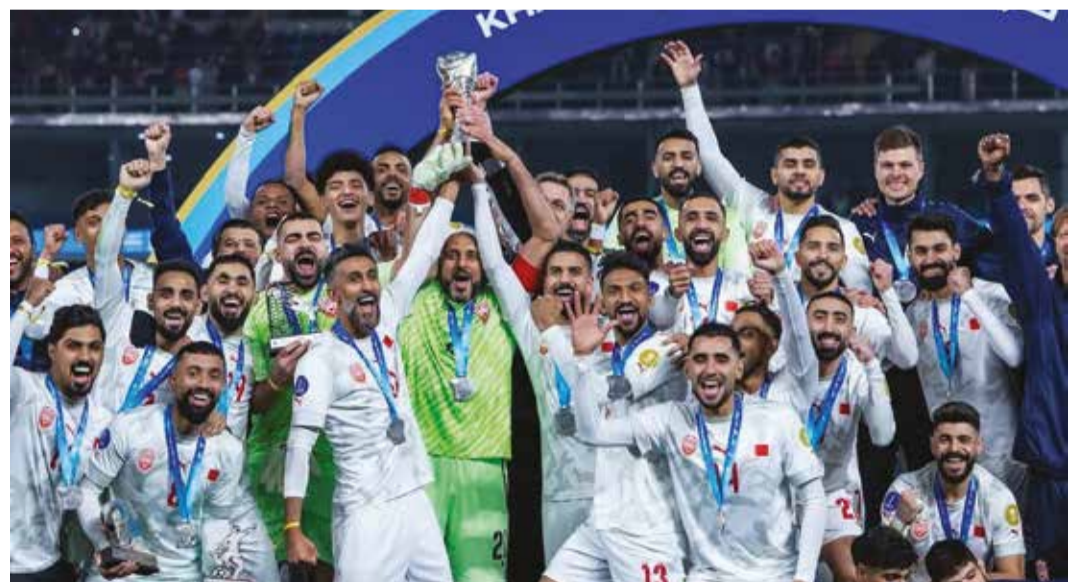
Bahrain's national football team celebrate winning the Gulf Cup last year