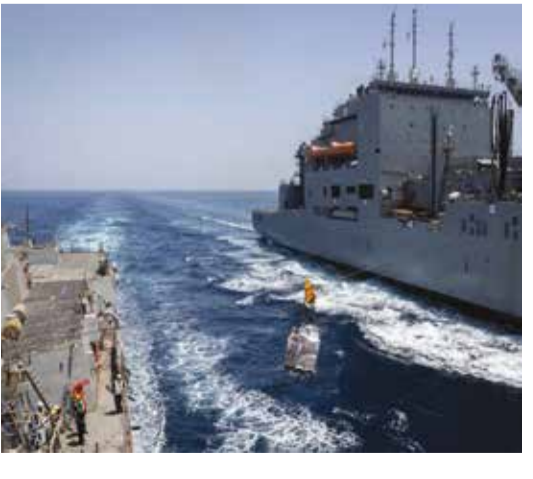
USNS Wally Schirra (T-AKE 8) replenishes the guided-missile destroyer USS Delbert D. Black (DDG 119) while at sea. Underway replenishments allow U.S. Navy ships to receive fuel, food, munitions, and essential supplies.