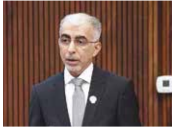
Ebrahim Al Hawaj, Minister of Works

The project also includes a number of sea bridges and road links to the islands and districts north of Bahrain, along with connections to existing and planned roads across the kingdom.