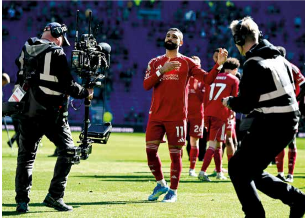
Liverpool's Egyptian striker #11 Mohamed Salah celebrates on the pitch after a match (file photo)

He had a public spat with Slot in December, declaring he had "no relationship" with the Dutchman after being dropped for three consecutive games, but quickly returned to the fold.