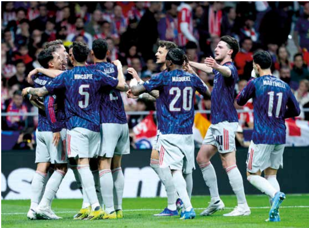
Arsenal players celebrate the opening goal scored by Arsenal's Swedish forward #14 Viktor Gyokeres during Champions League match against Atletico Madrid

Arsenal have the extra complication of balancing their Premier League efforts with a quest to win the Champions League for the first time.