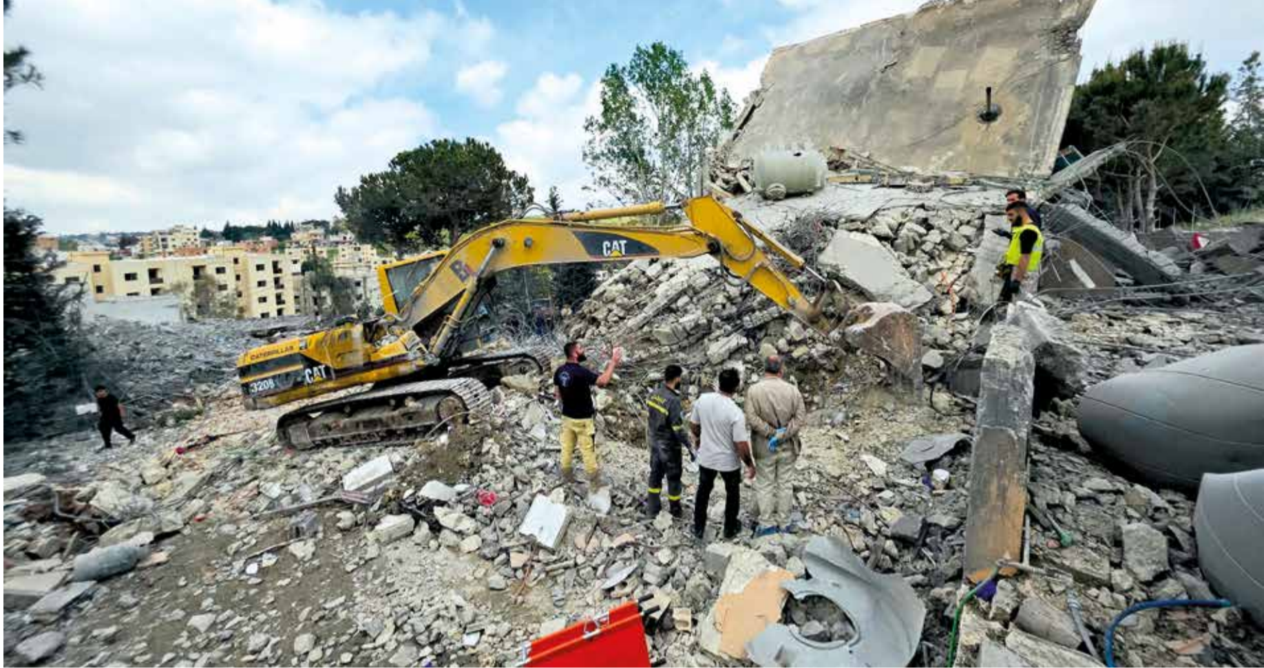
Lebanese first responders search for human remains amongst the rubble the day after a house was targeted in an Israeli airstrike in the southern Lebanese city of Nabatieh, yesterday. Israeli airstrikes on southern Lebanon killed at least 17 people on April 30, 2026, the Health Ministry announced, despite the ceasefire that has been in effect since April 17

"Those in power already speak 365 days a year, so let workers talk about the hardships they face at least one day a year," he said.