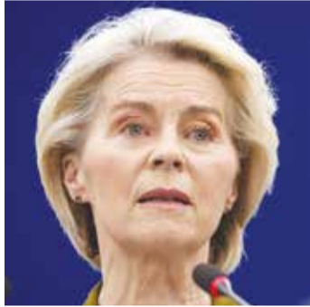
European Commission President Ursula von der Leyen

The deal, which eliminates tariffs on more than 90% of trade between the two sides,