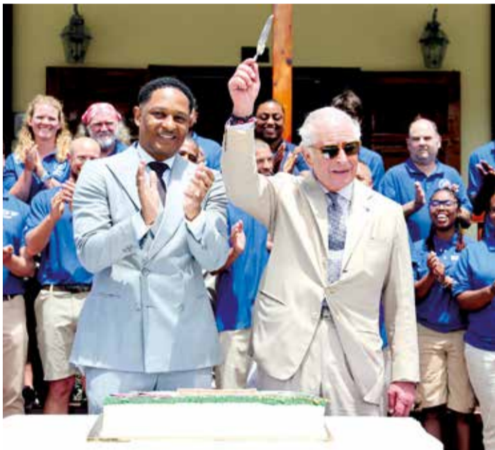
Britain's King Charles III cuts a cake to mark the centenary of the Bermuda Aquarium Museum

"Get home safe," said another member of the hundreds-strong crowd gathered in King's Square.