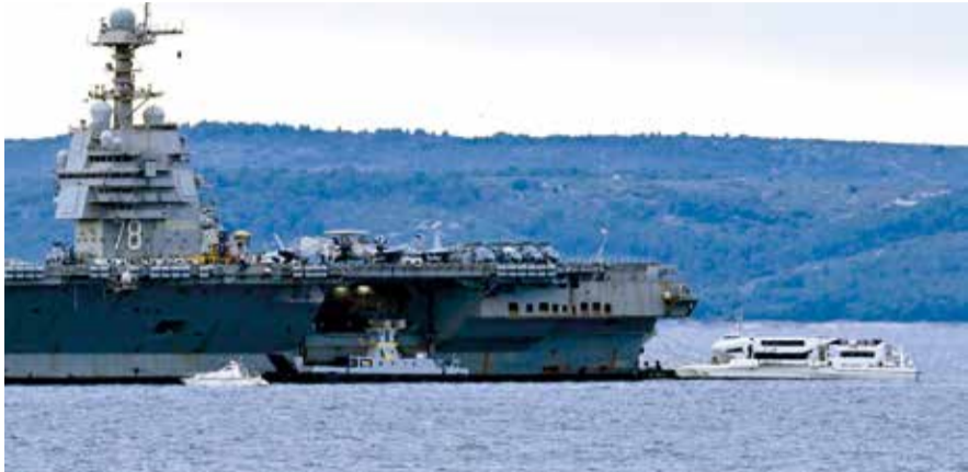
Harbour tugboats and other civilian vessels approach the U.S. Navy aircraft carrier USS Gerald R. Ford at an anchor point off the Croatian city of Split

The Ford has been at sea for more than 10 months -- a deployment that