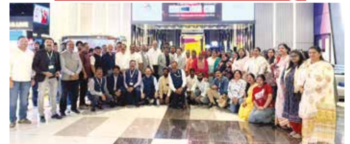
The Indian Community Welfare Association (ICRF Bahrain), in collaboration with Lulu Care, Epix Cinema, and Dana Mall, and supported by BBK, organised a special "Silver Screen Experience" at a cinema in Dana Mall, Sanabis. The initiative brought together around 250 workers from various sectors for a memorable day of entertainment and appreciation.