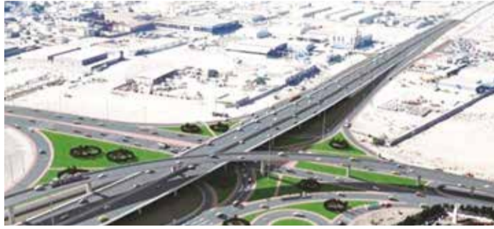
Shaikh Jaber Highway

Al Hawaj said the northern road is among the projects listed in the ministry's plans, with a role in completing a northern coastal corridor and allowing Bahrain's road network to carry more traffic. It also ties in with Bahrain's Economic Vision 2030 and the strategic plan for 2030.