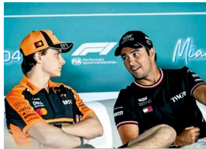
McLaren's Australian driver Oscar Piastri (L) and Cadillac's Mexican driver Sergio Perez attend a press conference

Verstappen had been a leading critic of this season's changes, accusing F1 of losing its identity