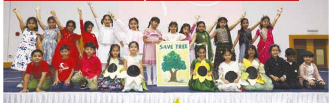
Bahrain Indian School celebrated International Dance Day with a vibrant event titled "Feet of Harmony", bringing together students, teachers and school leaders in a colourful showcase of rhythm and culture. The programme highlighted dance as a universal language that transcends borders and connects communities through artistic expression. Among the highlights was a creative performance portraying the stages of human life, with expressive choreography tracing the journey from childhood to old age. Students also presented a dynamic fusion of global dance styles, blending diverse traditions into a seamless display of movement and rhythm.