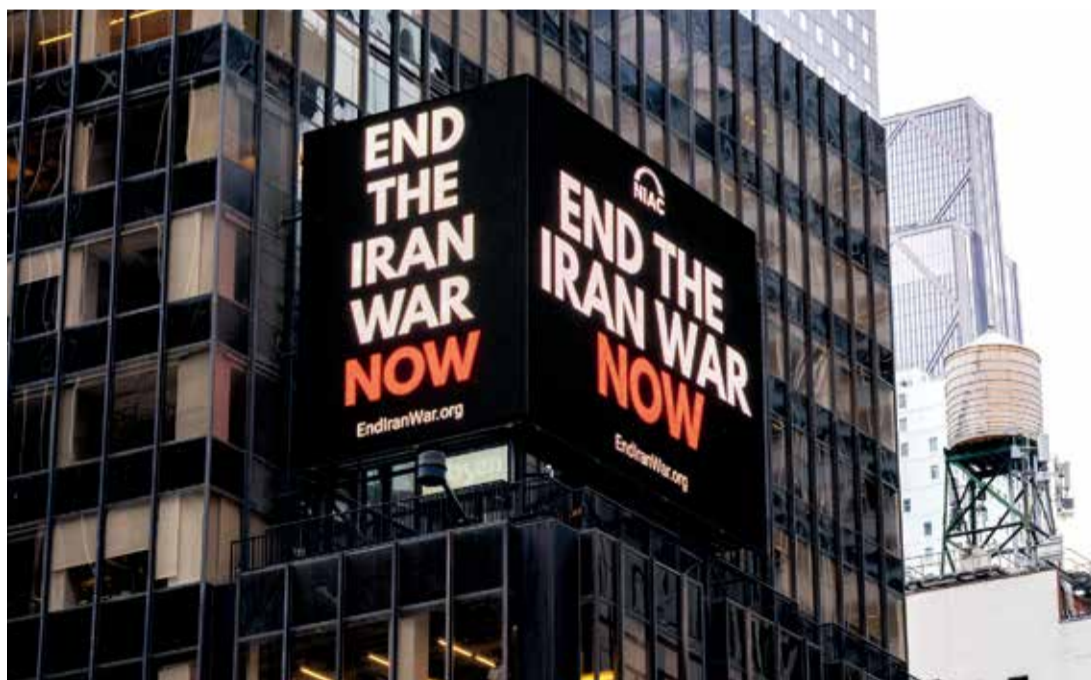
A digital billboard displays an image reading "end the Iran war now" in Times Square in New York City

The Wall Street Journal reported on Thursday that US