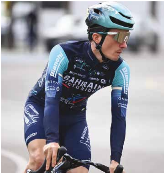
Pello Bilbao of Bahrain Victorious